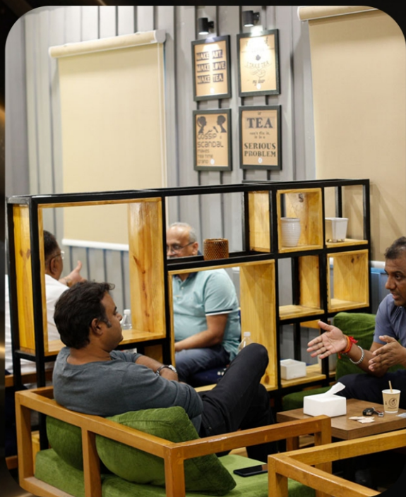
TEA / FAST FOOD PARLORS