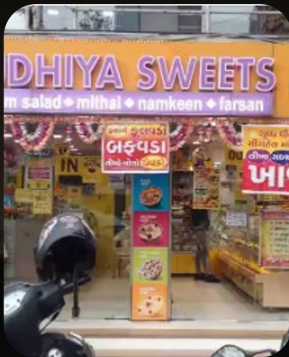
DAIRY PARLORS & SWEET MARTS