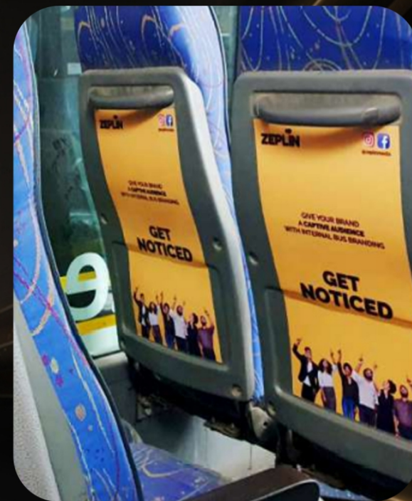
TRAVEL BUS INSIDE

Potential customers will be offered to scan QR code and become our Privileged Customer to get 10% discount for every current and future products of the company for lifetime.