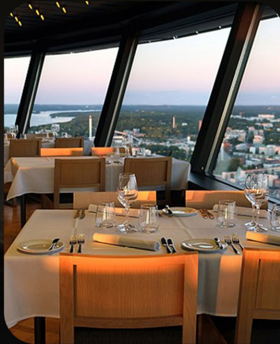
5 STAR+ HOTELS