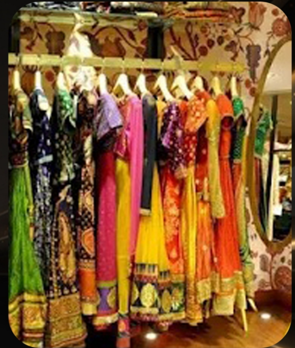
GARMENT & TAILOR SHOPS

Potential customers will be offered to scan QR code and become our Privileged Customer to get 10% discount for every current and future products of the company for lifetime.