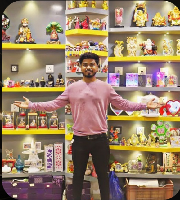
GIFT ARTICLE SHOPS